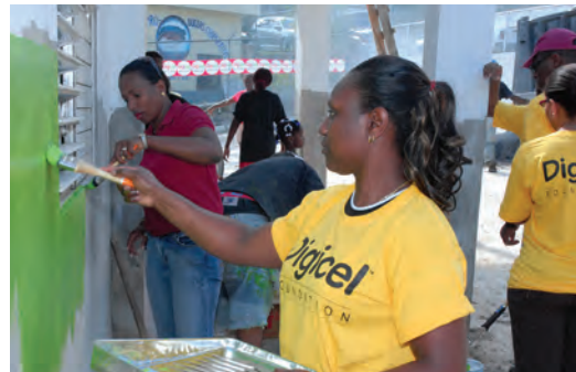
Digicel Foundation volunteers at the Flower Hill workday

January 11 th 2008 is a day to be remembered by the residents of St. James parish. Thanks to a J$9 million (approx. US$129,000) donation from the Digicel Foundation the Flower Hill Basic School was able to be officially reopened to the more than 50 pupils who attend the basic school from the surrounding communities.