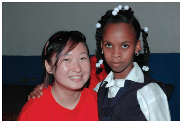
Circle K Volunteer with Allman Town pupil