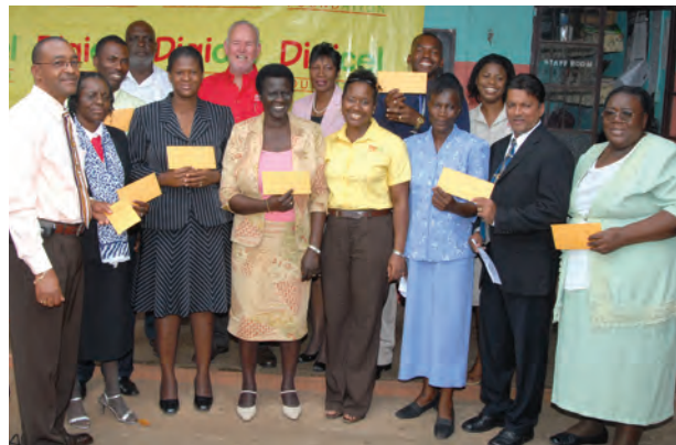
Recipients of Digicel Foundation hurricane Dean Aid