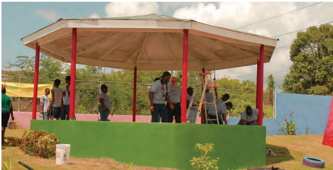
Putting finishing touches to the newly constructed gazebo in St. Jago South community

Thanks to this project, both adults and children alike can enjoy the improved and beautified surroundings and come together as families and neighbors in this communal space.