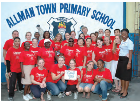
Pacific Northwest Circle K volunteers