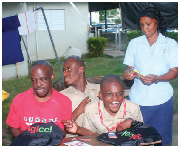
Tegwyn Unit residents enjoy the festivities