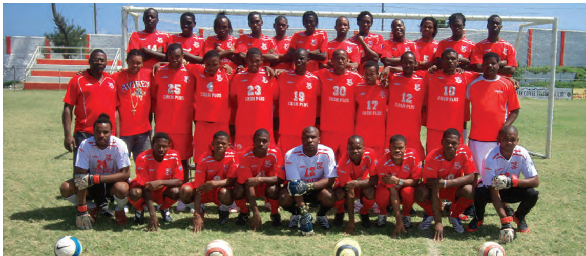
St. Georges Football Club, Portland

Located in the quiet coastal parish of Portland, the St. Georges Sports Club in the Buff Bay community received a much needed face-lift to their football field and facilities thanks to assistance from the Digicel Foundation. As a team from the National Premier Football League, St. Georges was unable to host Premier League matches due to the lack of seating and spectator facilities which is stipulated by the Jamaica Football Federation. This would result in the team having to travel to neighbouring parishes to play at suitable football fields which was an additional cost for both players and spectators.