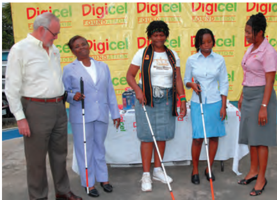
Jamaica Society for the Blind volunteers demonstrate how to walk with a white cane