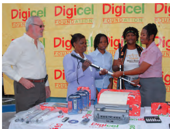
Digicel Foundation official handover to the Jamaica Society for the Blind