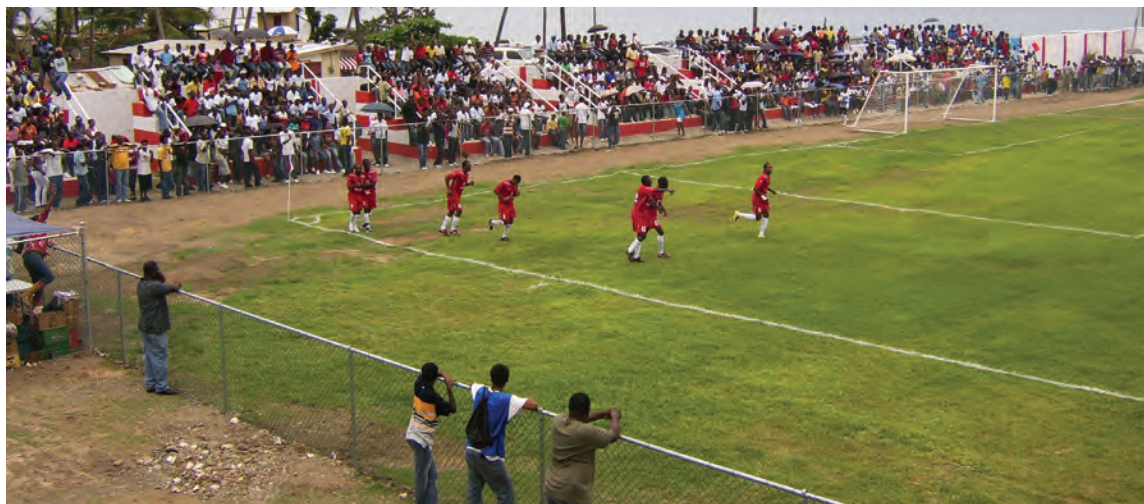
Football team at play on the completed field

At the official opening ceremony hosted in March 2008, two friendly football matches were played between the community, Digicel and media teams with footballs, bags, bibs and other items being distributed to all teams. Lynch Park football field is the only outdoor sports facility in the parish of Portland.