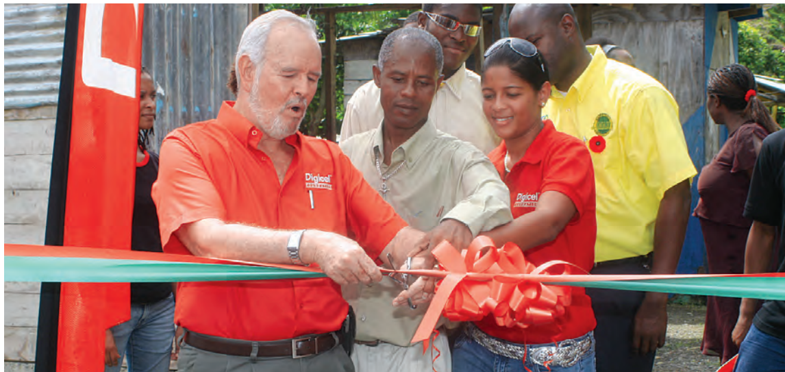
Official opening of Bath Multi-Purpose Court, St. Thomas