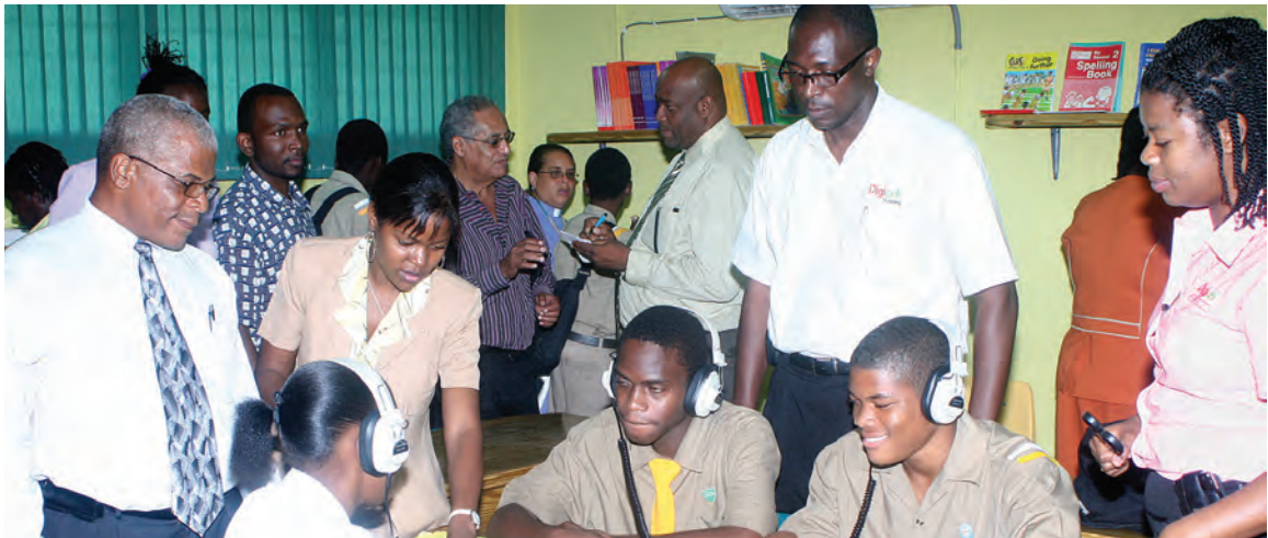
Students hard at work in the newly refurbished reading and resource room