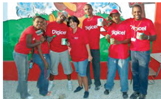
Digicel Haiti Foundation volunteers at a work day

The welcome that the Digicel Foundation has received in Haiti has been phenomenal. Government, NGOs and aid agencies have given invaluable support and advice and community members from across Haiti have banded together to offer labour and other resources to ensure that these schools were completed and were able to offer a brighter future to the many pupils they will benefit. During the construction of the Durissy Petit Goave in the West Department, community involvement was encouraging and inspiring to witness – each day seeing men, women and children all pitching in to carry building materials in pots and pans to the top of the mountain where the school is situated.