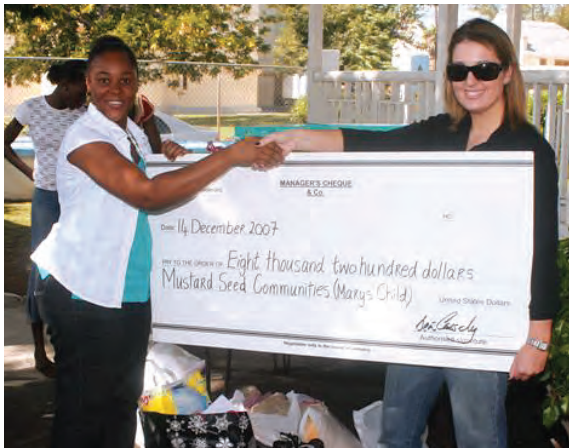
Hand over of cheque to Mary's Child

The money donated will be used to upgrade and refurbish the home economics centre which teaches the residents how to cook and prepare healthy and nutritious meals for themselves and their babies. This was a truly remarkable project in many different ways and shows that with team work, great results can be achieved.