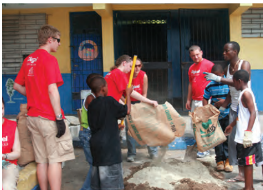
Circle K volunteers, community members and students hard at work mixing cement