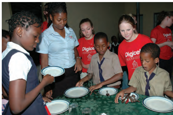
Allman Town students learn how to set a table