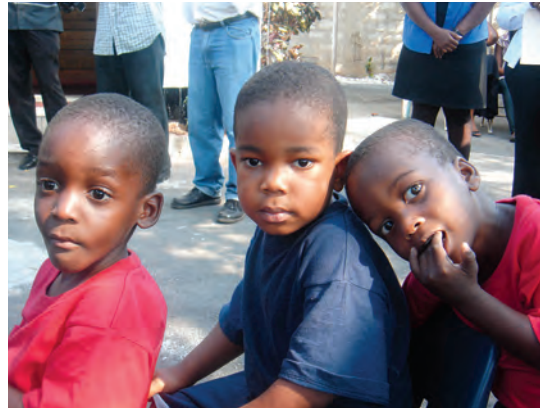
Pupils of the Little Angels Learning Centre

Since opening its doors in 1992, Mary's Child has provided a safe haven and refuge to many underage expectant mothers and babies. As part of the Mustard Seed Community, whose projects provide support to housing, economic and community projects around Jamaica and beyond, Mary's Child is an organization that provides home schooling, counselling, life skills and a much needed stable home environment to abused girls between the ages of 9 and 18 years old. These underage girls typically come from homes where they are abused, abandoned, neglected and lack the guidance of a parental figure.