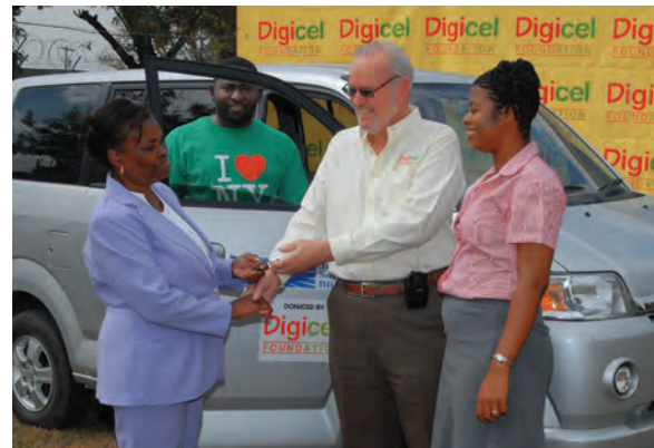
Digicel Foundation donation of a mini bus in 2007