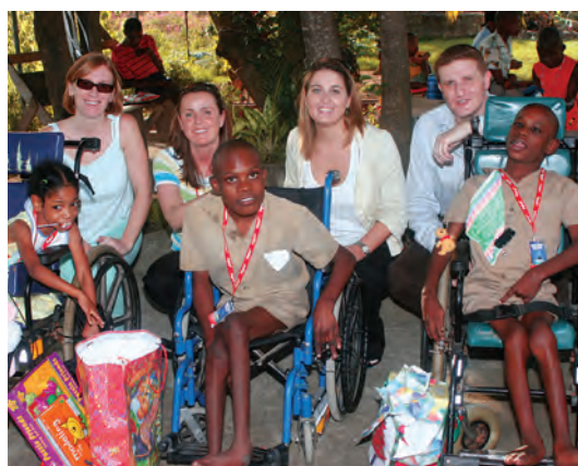
Digicel Foundation volunteers with Tegwyn Unit Children