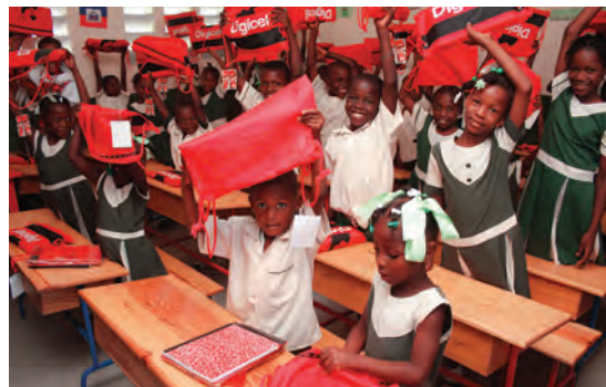
Excited Haitian students in their newly equipped school

Digicel Foundation Haiti is not funded from the Digicel Foundation Jamaica. Denis O' Brien, Digicel Group Founder and Chairman and Digicel Foundation Haiti Patron, promised to build 20 primary schools in Haiti, two in each district around the island, within a timeframe of one year - a huge task according to any standards! The first school to be completed was the Ecole Mixte Lageho, a primary school in the hurricane ravaged rural community to Mazeau. Digicel staff and community members worked together to complete this project in a record time of 12 weeks. The new school features six furnished classrooms, a library, kitchen and canteen as well as school supplies and books for 250 students donated by the Digicel Foundation Haiti.