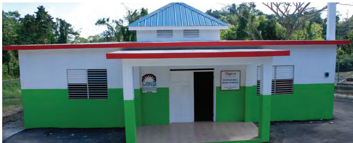
Newly completed Flower Hill Basic School, St. James