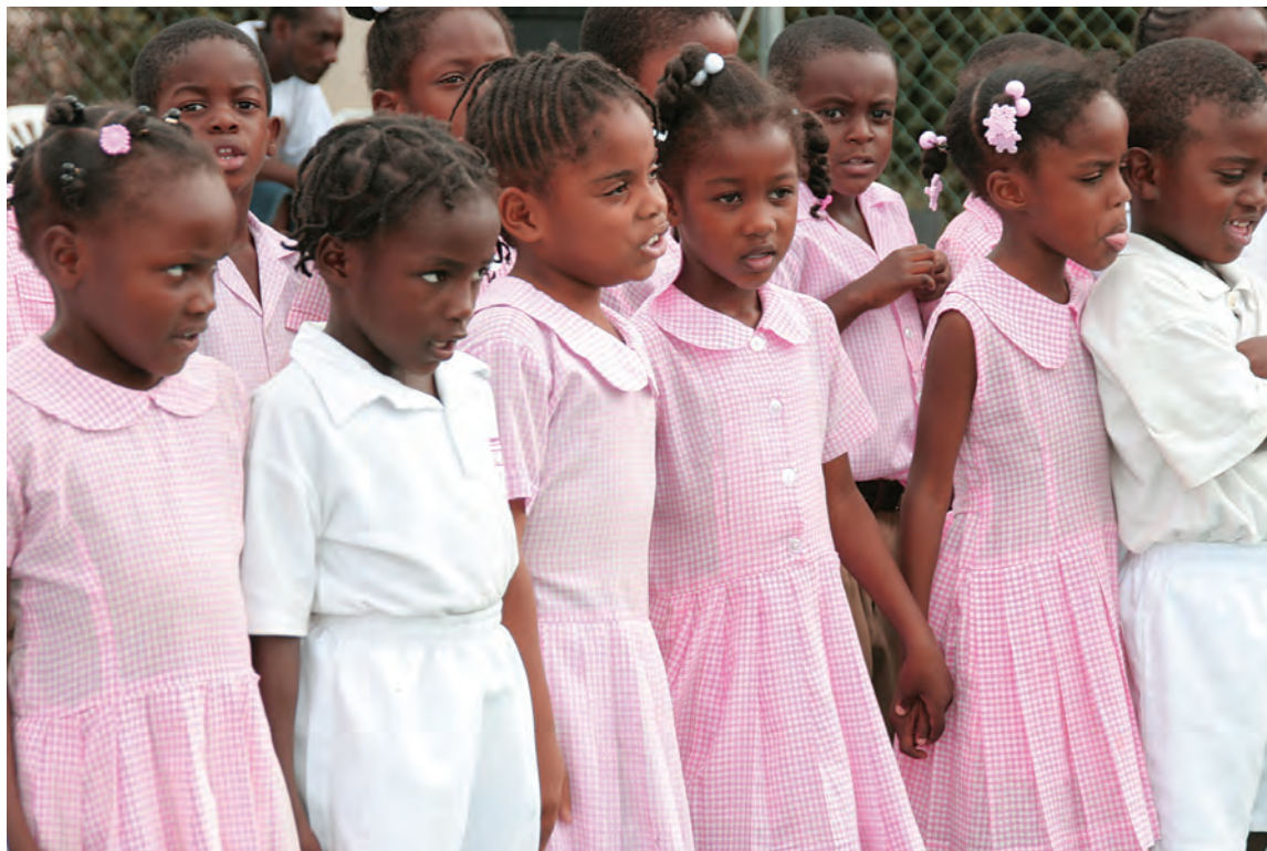
Children of Farm Heights community at the opening of Multi-Purpose Court

Looking to the year ahead we welcome the many challenges that lie in store for us at the Digicel Foundation as well as the many new opportunities that will be presented to us through various projects and partnerships. We will continue to seek ways to help empower more individuals and achieve measurable success in their daily lives. Social investment will continue to be part of our core focus through projects related to the upliftment of communities and individuals. We will also continue our work on educational projects in the area of construction of schools and resource centres and investment in the youth of Jamaica.