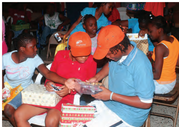
Christmas came early for the children of the National Children's home