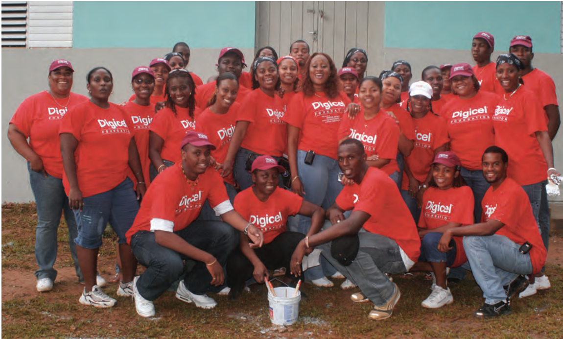
Digicel Foundation volunteers at Waldensia Labour Day project

D igicel started its journey in Jamaica seven years ago with the establishment of Digicel Jamaica. Our sole purpose is to connect people via mobile phones and add value to their lives through the medium of telecommunication services. Our core belief has always been that as we grow as a company, so too should our communities grow with us. With this in mind, the Chairman and Founder of Digicel Group, Denis O'Brien, set up the Digicel Foundation Jamaica in September 2004. The primary objective is to support and develop the communities in which our employees live and work and where we do business. We strive to ensure that communities are healthy, primarily through the support of community based activities. Our focus falls predominantly on social, cultural and educational projects. We are funded solely by yearly contributions from Digicel Jamaica and additional donations by our Patron.